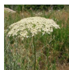
Queen Anne's Lace