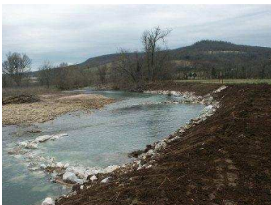
Redirective rock weir and sloped bank

Stream bank erosion can be a large-scale problem for both landowners living along the Kings and its tributaries and downstream users who are the recipients of the yearly loads of sediment.