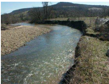
Before bank stabilization of Osage Ck site